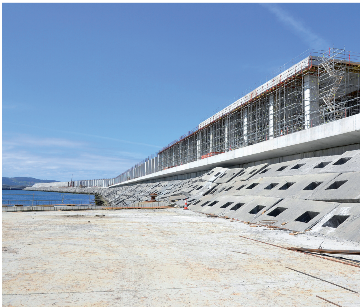
Protection gallery of the outer harbour of Punta Langosteira. La Coruña