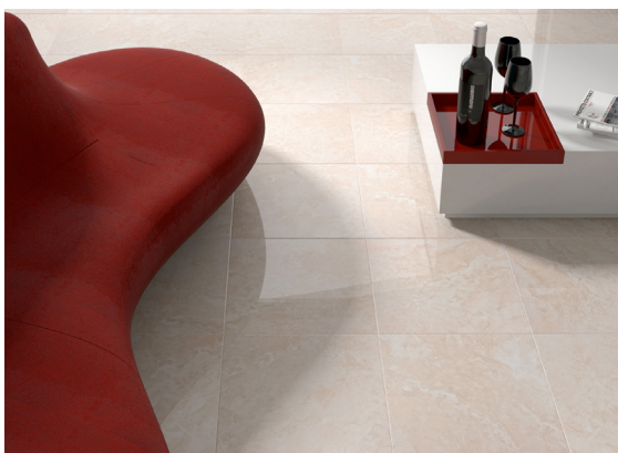
Figure 1 – Installed product

The glazed ceramic tile included in the study covers different models, the formats within the scope of the study are 45x45 cm and 60x60 cm.