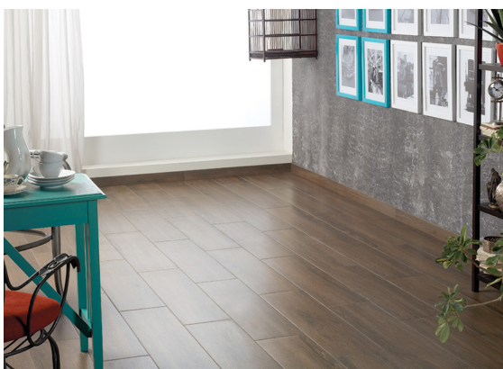
Figure 1 – Installed product