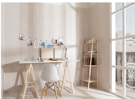
Figure 1 – Installed product