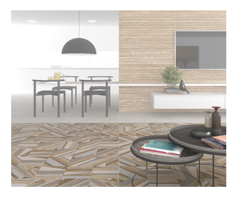
Figure 1 Installed product.

The spray dryer includes a simultaneous heat and electricity cogeneration system by means of gas turbines, using natural gas as fuel. The combustion of natural gas provides hot gases directly to the drying stage. The electrical energy generated is partly used in the industrial plant, thus reducing the electrical requirements of the grid, and the rest is fed into the grid for sale and subsequent distribution. In this study, the generation of electricity sold to the grid has been considered as a moved load, specifically, to thermoelectric production from fuel oil/gas, according to the rate reported in Eurostat 2018.