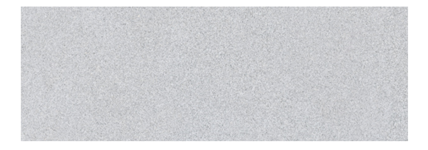
Figure 4 Picture of an earthenware tile

The environmental burdens and benefits of obtaining secondary material from waste generated at the manufacturing stage (waste such as cardboard, plastic and wood), at the installation stage (product losses, tile packaging waste: cardboard, plastic and wood) and at the end of life of the product have been considered.