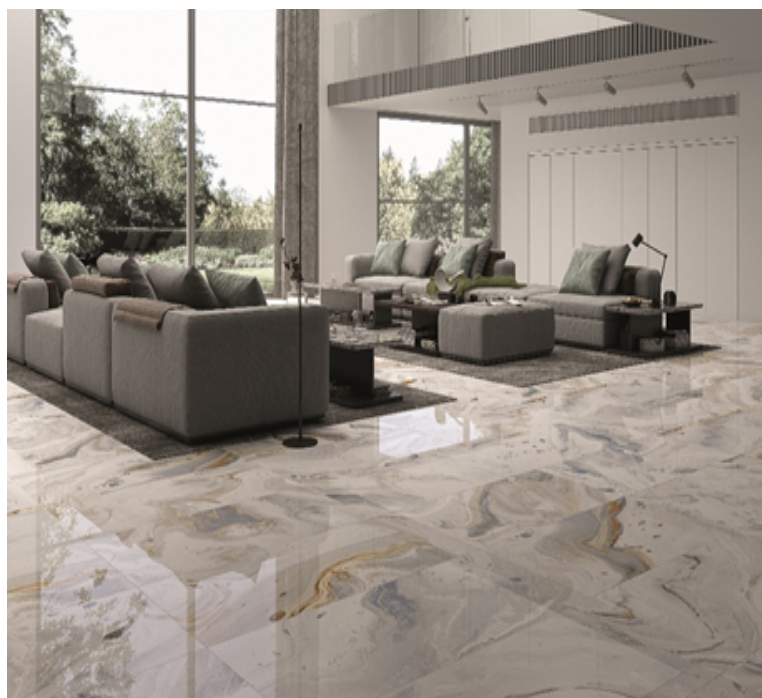
Figure 1 Installed product.

The spray dryer includes a simultaneous heat and electricity cogeneration system by means of gas turbines, using natural gas as fuel. The combustion of natural gas provides hot gases directly to the drying stage. The electrical energy generated is partly used in the industrial plant, thus reducing the electrical requirements of the grid, and the rest is fed into the grid for sale and subsequent distribution. In this study, the generation of electricity sold to the grid has been considered as a moved load, specifically, to thermoelectric production from fuel oil/gas, according to the rate reported in Eurostat 2018.