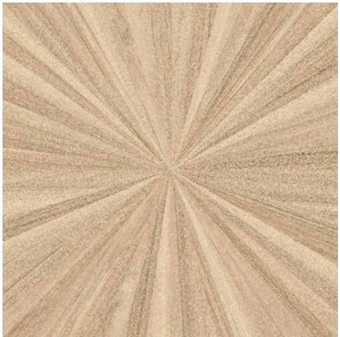
Figure 4 Picture of a porcelain stoneware tile

The environmental burdens and benefits of obtaining secondary material from waste generated at the manufacturing stage (waste such as cardboard, plastic and wood), at the installation stage (product losses, tile packaging waste: cardboard, plastic and wood) and at the end of life of the product have been considered.