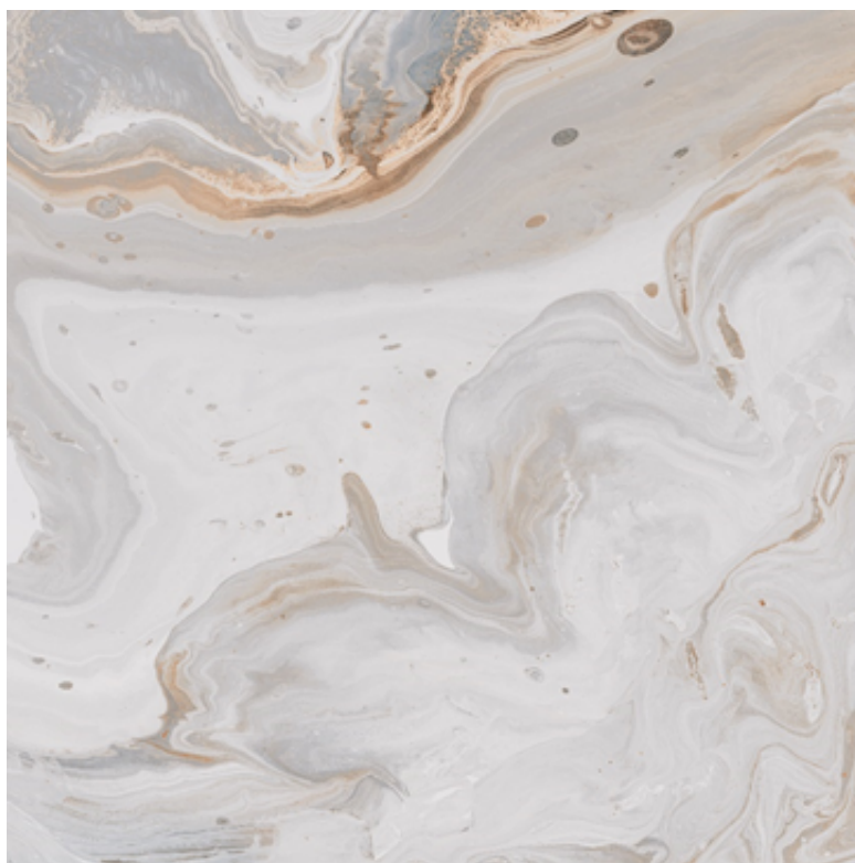
Figure 3 Picture of a porcelain stoneware tile

The waste derived from the packaging of the pieces is managed separately according to the geographical location of the installation site. Otherwise, 3% of product losses have been considered at the installation stage.