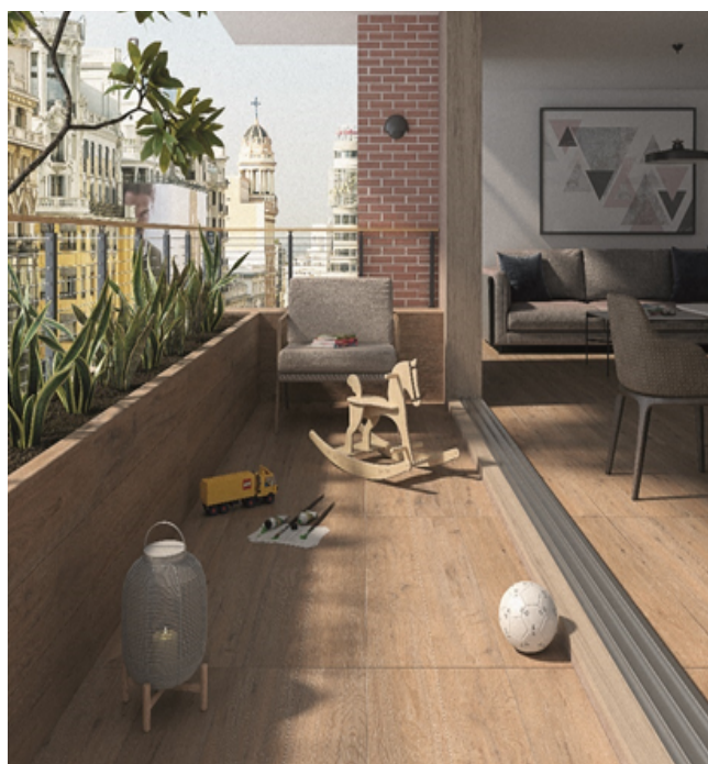
Figure 1 Installed product.