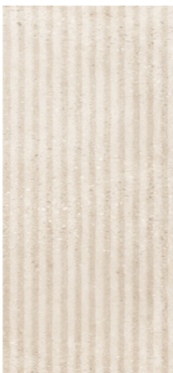
Figure 3 Picture of an earthenware tile

The waste derived from the packaging of the pieces is managed separately according to the geographical location of the installation site. Otherwise, 3% of product losses have been considered at the installation stage.