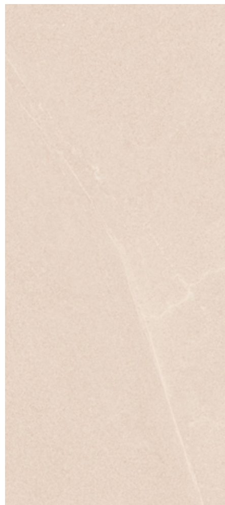
Figure 4 Picture of an earthenware tile

The environmental burdens and benefits of obtaining secondary material from waste generated at the manufacturing stage (waste such as cardboard, plastic and wood), at the installation stage (product losses, tile packaging waste: cardboard, plastic and wood) and at the end of life of the product have been considered.